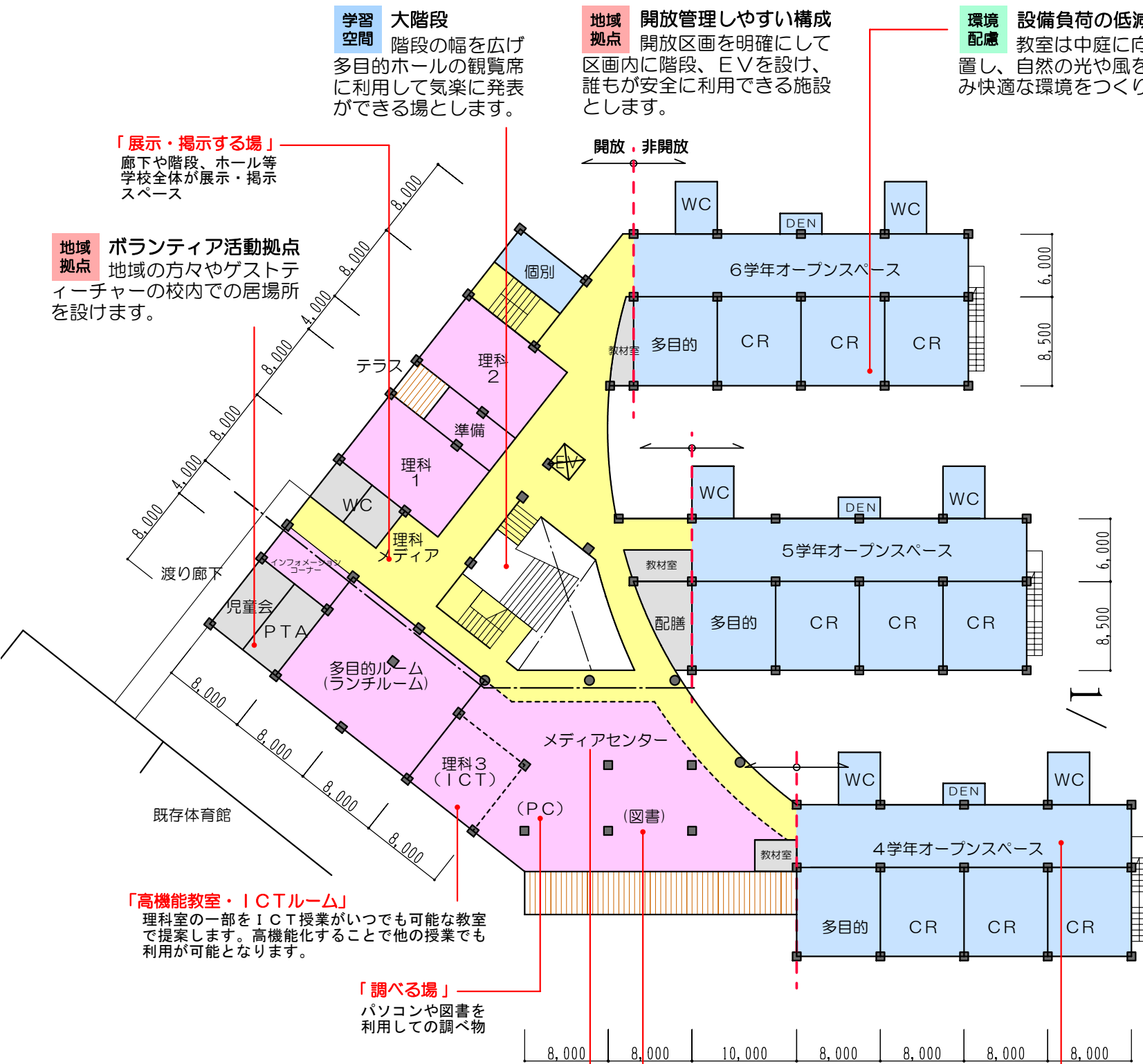
2階平面図 1 / 500